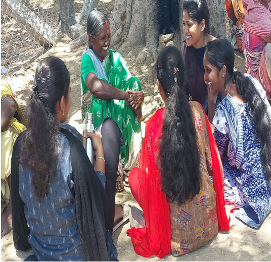
Students of Annammal College of Education having one to one chat with the villagers about plastic usage and waste.

On Aug 29th, DAIA and Annammal College organized an awareness program on 'Plastic Waste' at Jambulingapuram.