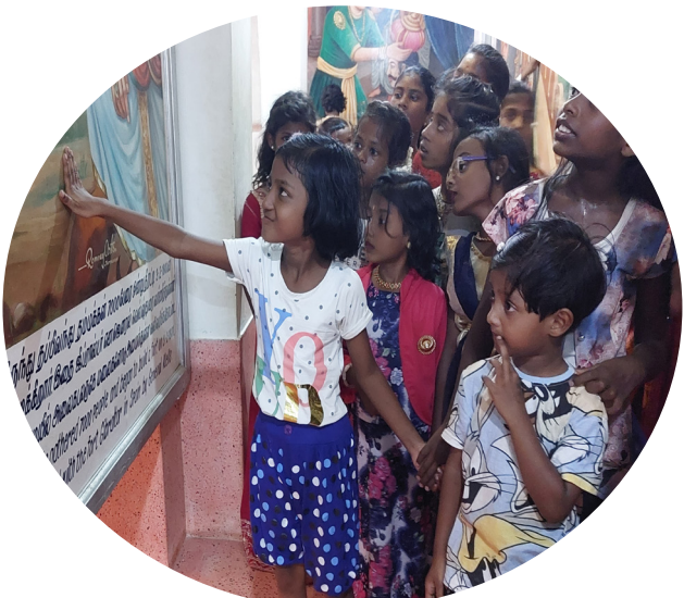
Children who create future history by looking at historical leaders.