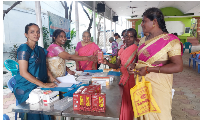
Medicines and tonic are distributed to the patients.